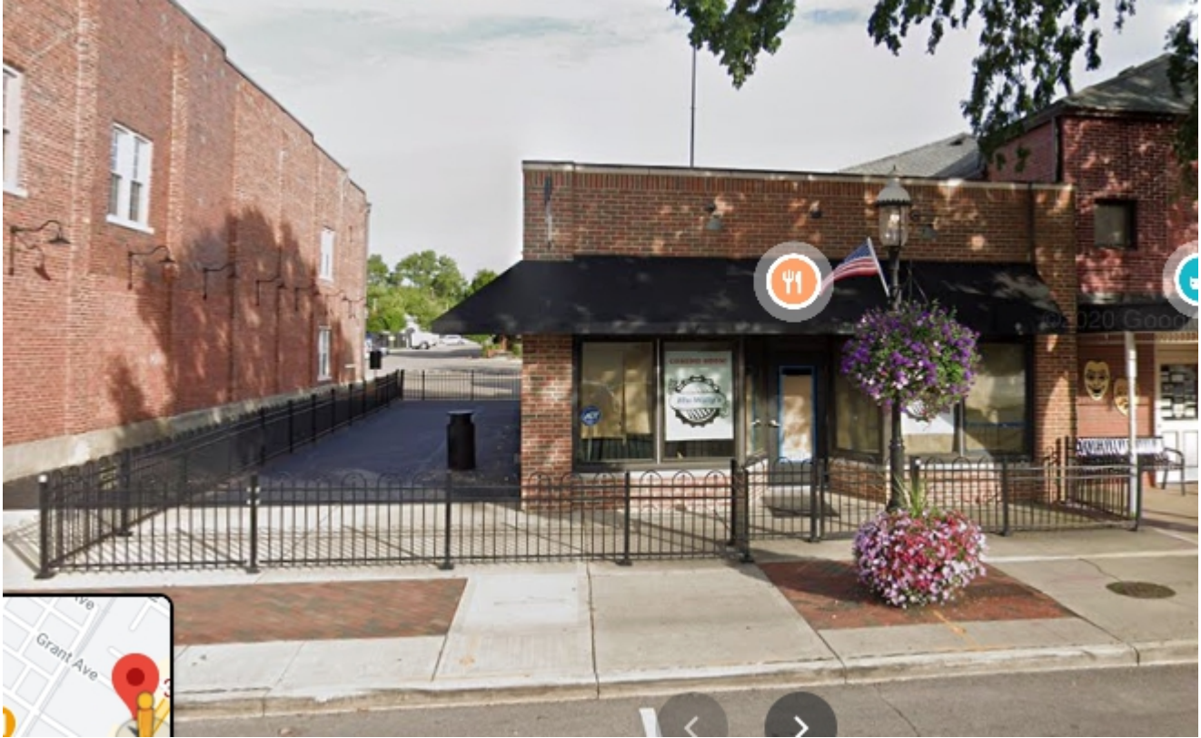
Blu-Willy's Existing East Facade facing Broadway