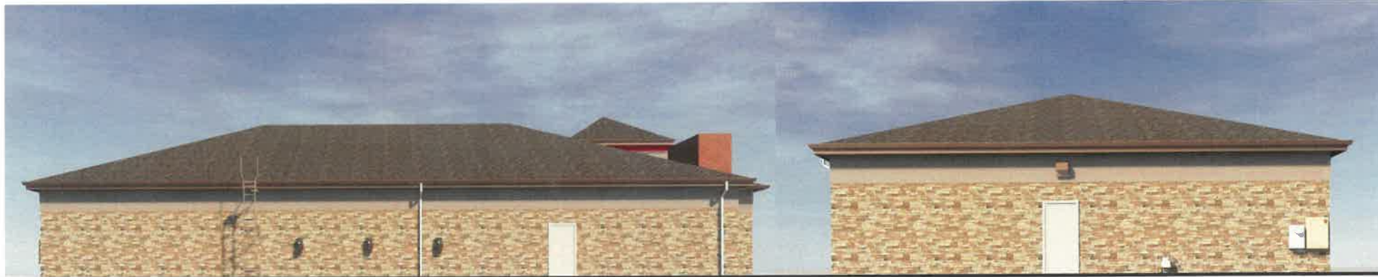
3 PROPOSED REAR ELEVATION SK2 SCALE: N.T.S.