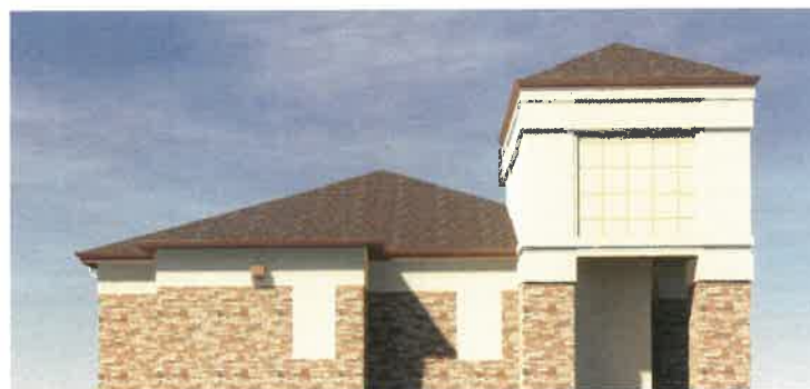
2 EX EXISTING LEFT ELEVATION SCALE: N.T.S.