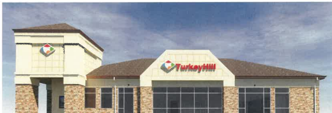
1 EX EXISTING FRONT ELEVATION SCALE: N.T.S.