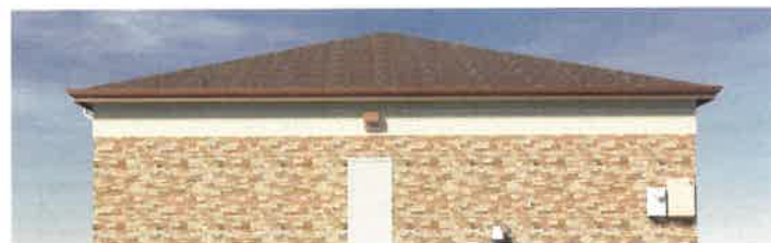
2 EX EXISTING RIGHT ELEVATION SCALE: N.T.S.