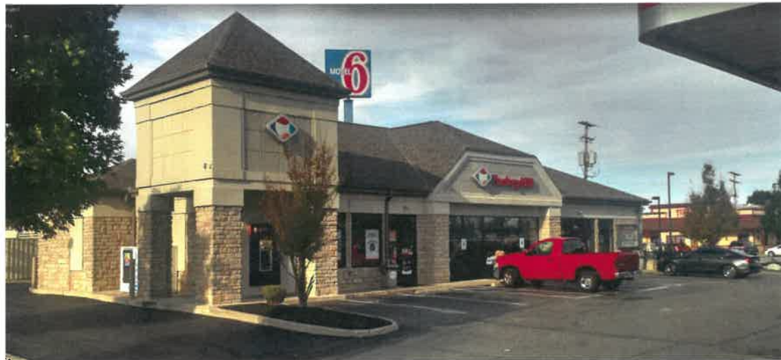
1 EX EXISTING PERSPECTIVE SCALE: N.T.S.