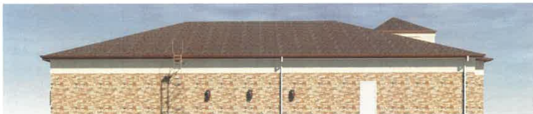
1 EX EXISTING REAR ELEVATION SCALE: N.T.S.