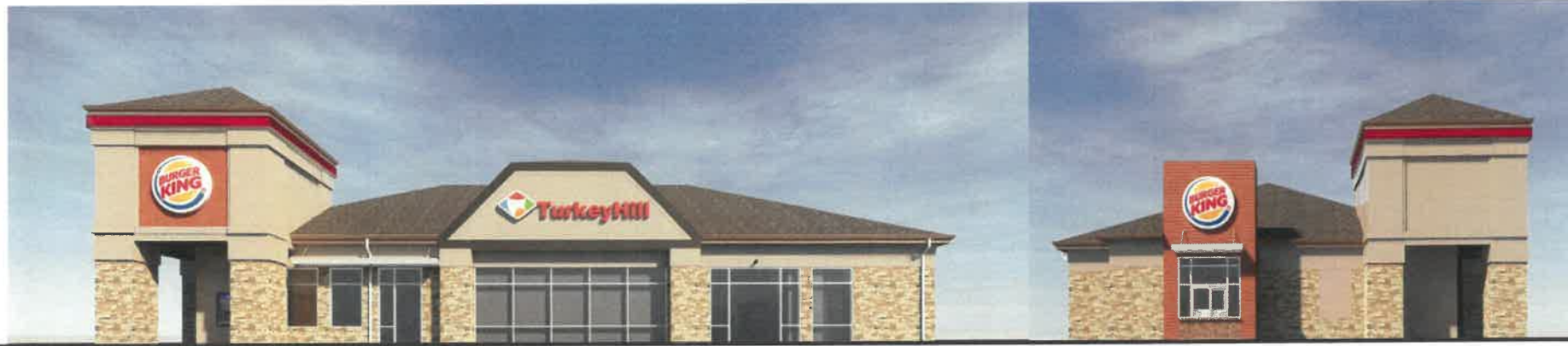
1 PROPOSED FRONT ELEVATION SK2 SCALE: N.T.S.