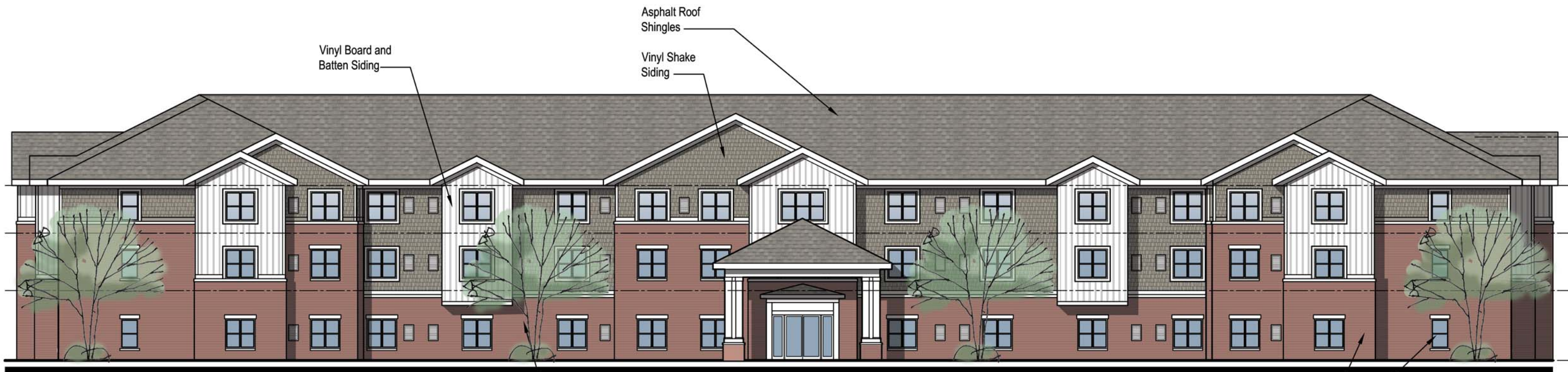
1 North Elevation (Main Entry) Scale: 1/16"=1'-0"

Asphalt Roof Shingles Vinyl Shake Siding Vinyl Board and Batten Siding Horizontal Vinyl Siding