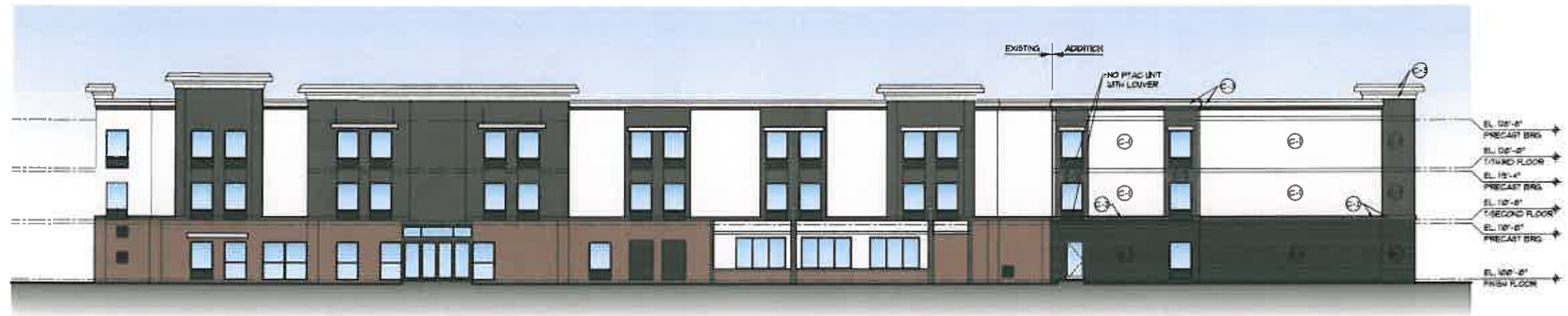
1 SOUTH ELEVATION SCALE: 3/32" = 1'-0"