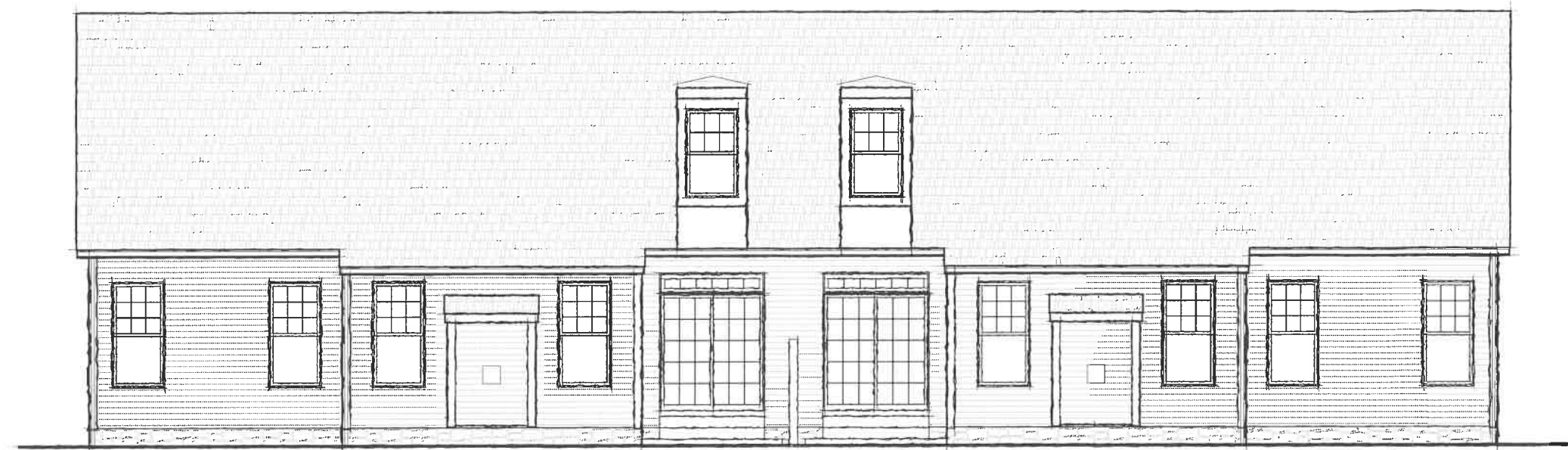
Rear Elevation Scale: \frac{1}{8}'' = 1'-0''